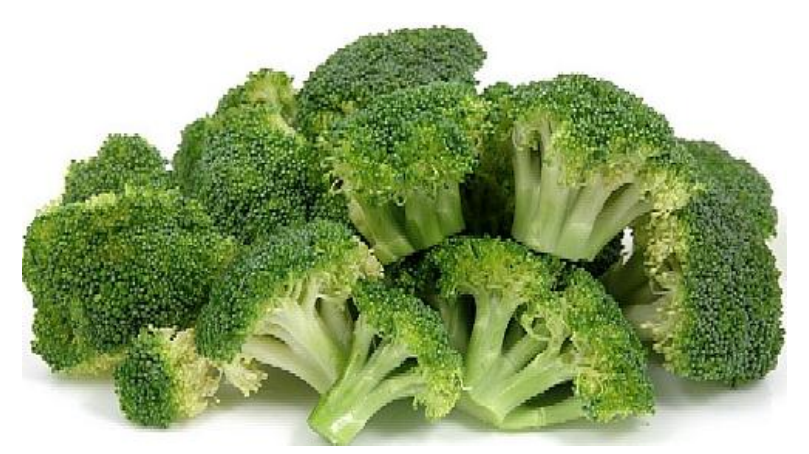
Fig. 1: Broccoli

George Mateljan Foundation 2009, Broccoli is high in vitamins C, K, and A, as well as dietary fiber; it also contains multiple nutrients with potent anti-cancer properties, such as diindolylmethane and small amounts of selenium. As per 2007 "Diindolylmethane Information Resource Center at the University of California, Berkeley A single serving provides more than 30 mg of Vitamin C and a half-cup provides 52 mg of Vitamin C.